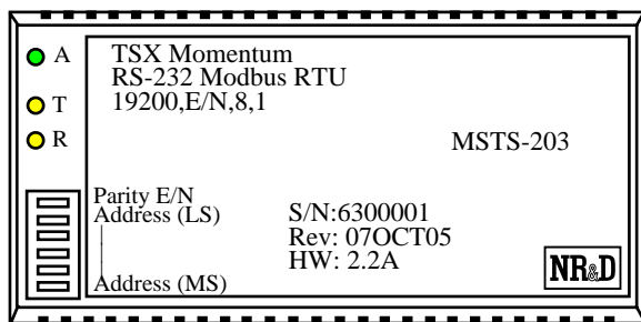
Figure 1 MSTS-203 Layout

The MSTS-203 is powered by the Momentum base. LED indicators show the state of POWER(A), Serial TX(T) and RX(R). The green POWER LED should be on if the MSTS-203 is properly powered by the base. The A light will flash slowly if the unit is set to slave address 0. The yellow T light is on while the MSTS-203 is transmitting data while the R light indicates data arriving at the MSTS-203.